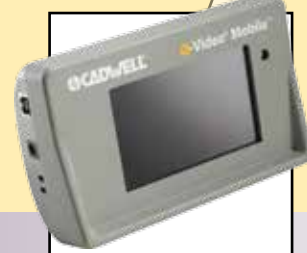
Q-Video Mobile Camera