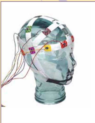
10/20 BraiNet® Template

The flexible design of Cadwell's amplifiers and software allows the use of almost all standard electrodes and accessories. Cadwell offers a comprehensive line of consumables for neurological monitoring, including cEEG, PSG, Clinical and Ambulatory EEG. Items can be purchased via estore.cadwell.com or by calling us.