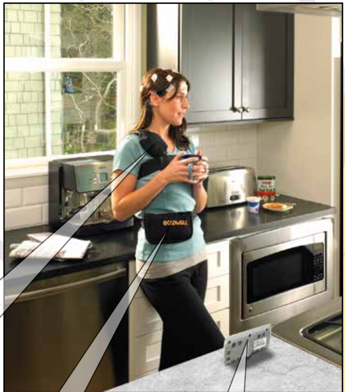
A typical Ambulatory EEG patient setup

The system includes a recorder and D cell batteries. The amplifier supplied includes a shoulder or belt mounted pouch. The recorder uses a compact flash card to store EEG data. A voice event microphone allows the patient to record voice events that are saved and time synchronized with EEG data. The patient can press the event button on the recorder as needed during the data collection process. Q-Video Mobile can be added to collect synchronized digital video and audio with the Cadwell Q-Video Mobile camera.