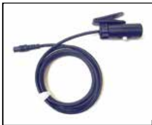
Voice Event Microphone