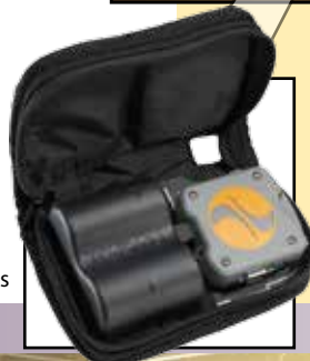
Recorder with batteries