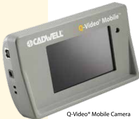
Q-Video® Mobile Camera