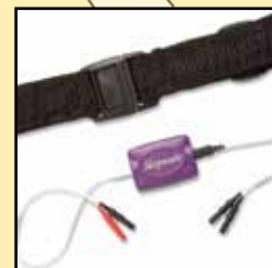
Respiratory Effort Belts