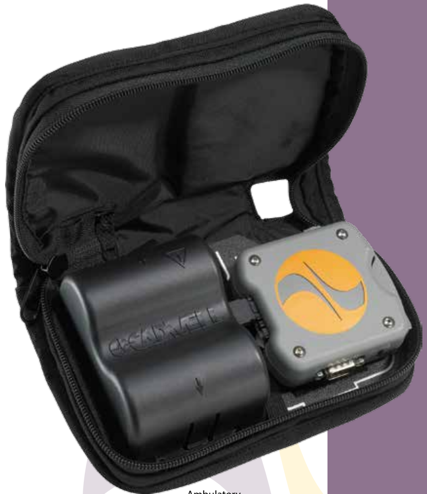
Ambulatory recorder with battery pack