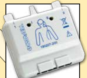
EasyNet® nasal pressure module