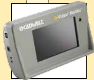
Q-Video Mobile Camera