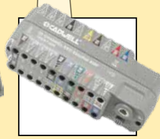
Easy Ambulatory 32 channel EEG Color Coded Amplifier (in pouch)