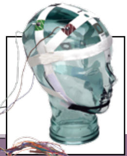
Sleep BraiNet® Template