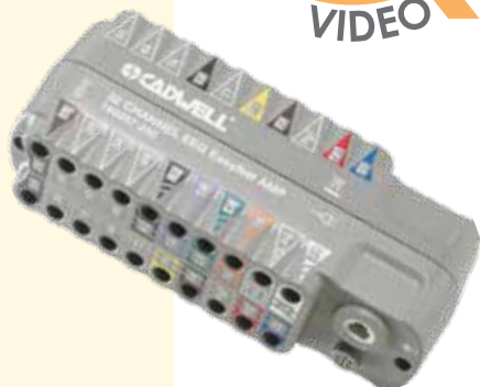
Easy Ambulatory 32 channel EEG Color Coded Amplifier