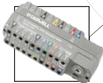
Amplifier pouch with a 32 channel EEG amplifier.