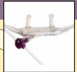
Nasal pressure/ thermal sensor combo