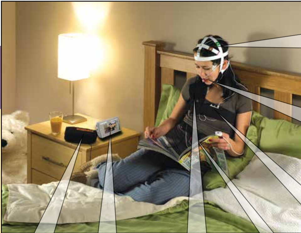
A typical Easy Ambulatory PSG patient setup

Easy Ambulatory PSG includes all of the EEG components, plus a Nasal Pressure/Snoring Module, Oximetry Module, Body Position Module, Limb Movement Modules, Respiratory Belts and other accessories.