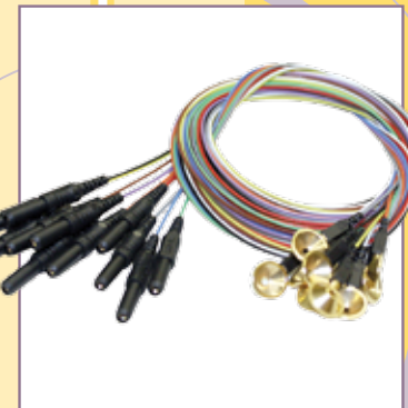
PSG/EEG Color Coded Electrodes