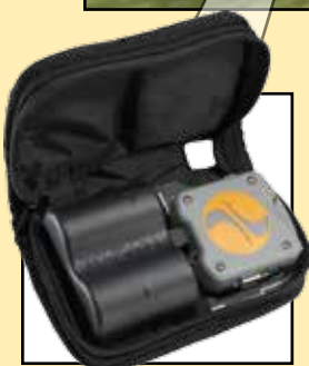
Recorder with batteries