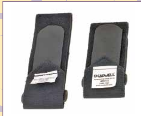
Limb and Shoulder Straps